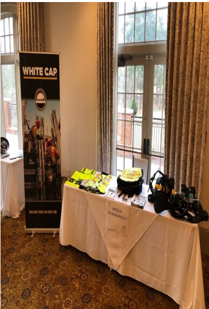
White Cap's Maven Project booth